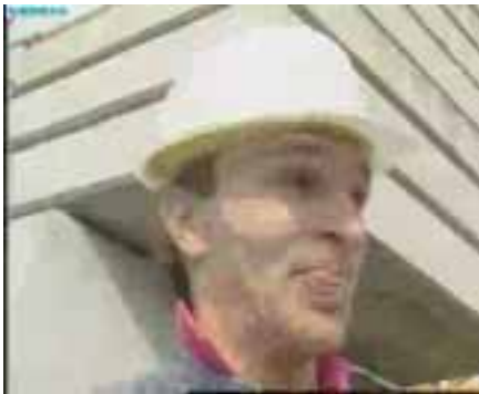
1) Without Filter