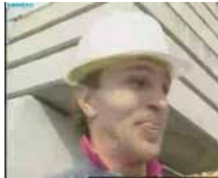
2) with H264/AVC Deblocking filter

AVC can give broadcasters 40-50% compression efficiency gains over today's optimized MPEG-2 bit rates, and is an integrated part of the future proof MPEG-4 system. This allows users to: